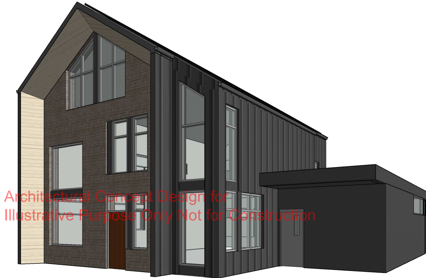
Model #2 South Facing Back Elevation- 3D View 3

Client/Project Eco Homes Embros Subdivision