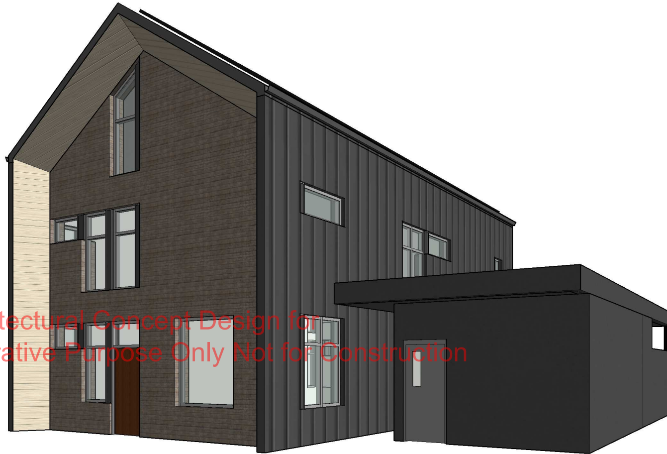
Model #6 North Facing Back Elevation- 3D View 3

Architectural Concept Design for Illustrative Purpose Only Not for Construction